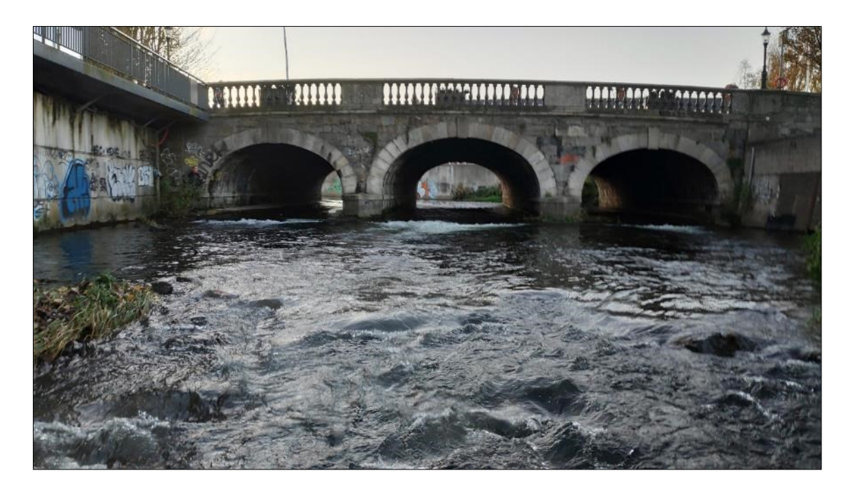
Plate 3.3 Representative image of site T3 on the River Tolka at Frank Flood Bridge (facing upstream)