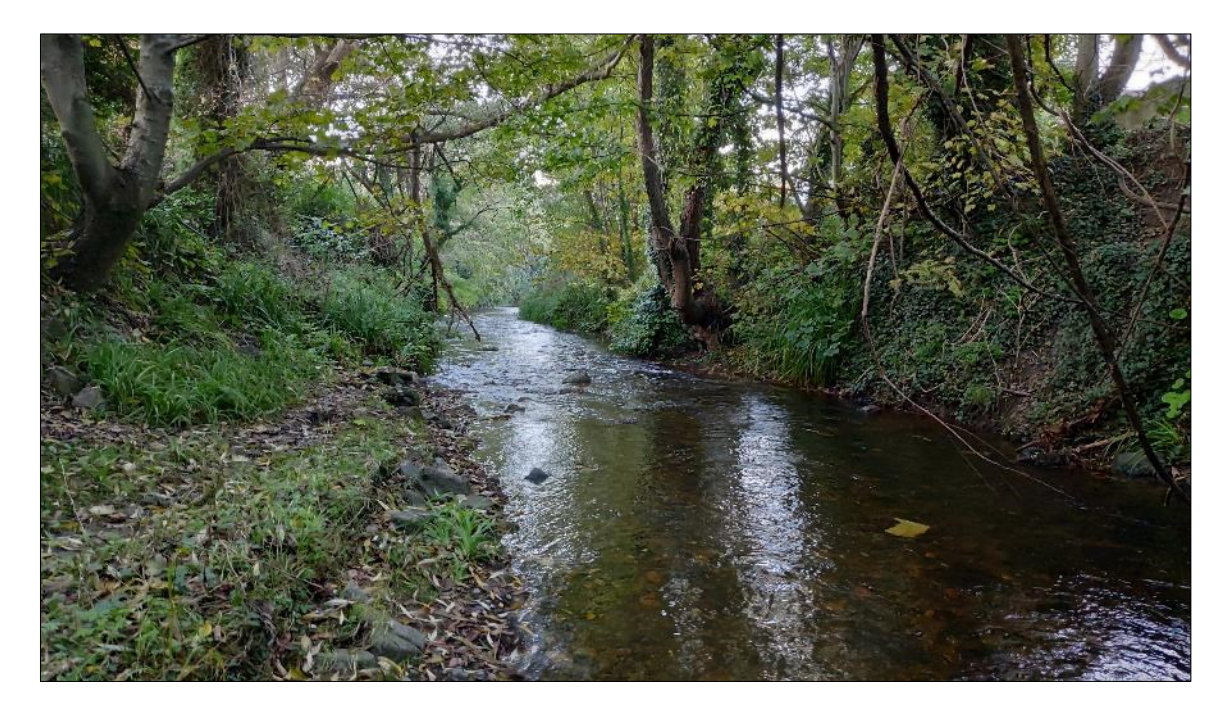
Plate 3.7 Representative image of site O3 on the Owendoher River (facing downstream)

In summary, site O3 showed excellent salmonid habitat with good habitat in particular. Additionally, habitat with high otter potential (including a possible breeding area) was also noted.