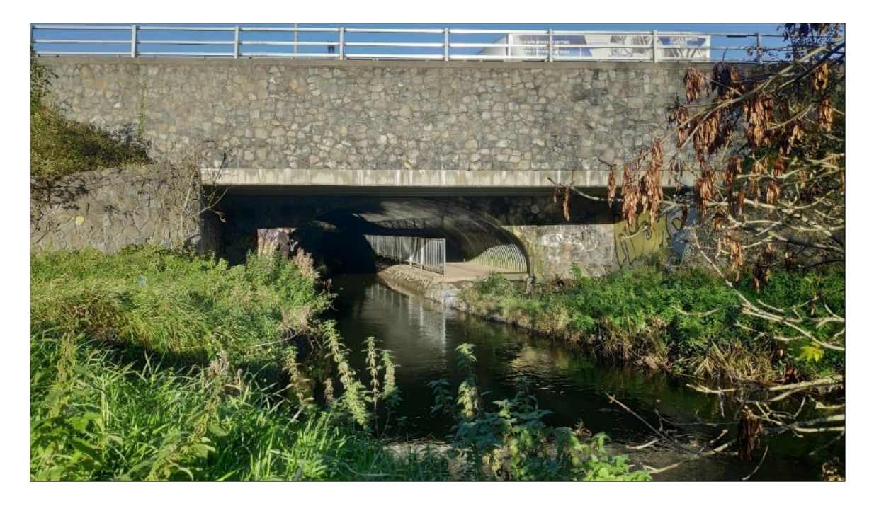
Plate 3.1 Representative image of site T1 on the River Tolka (facing upstream towards culvert)