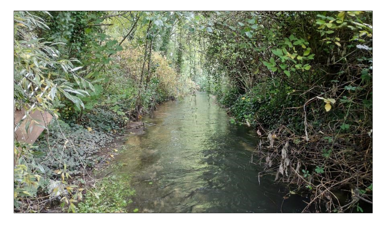
Plate 3.11 Representative image of site C2 on the River Camac (downstream of the culvert)

Plate 3.10 Representative image of site C2 on the River Camac (upstream of the culvert)