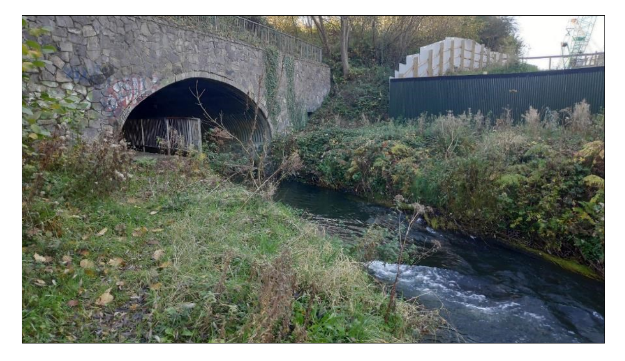
Plate 3.2 Representative image of site T2 on the River Tolka (facing upstream towards culvert)

The site T2 was found to be of moderate salmonid and European eel quality, with observable utilisation by otter.