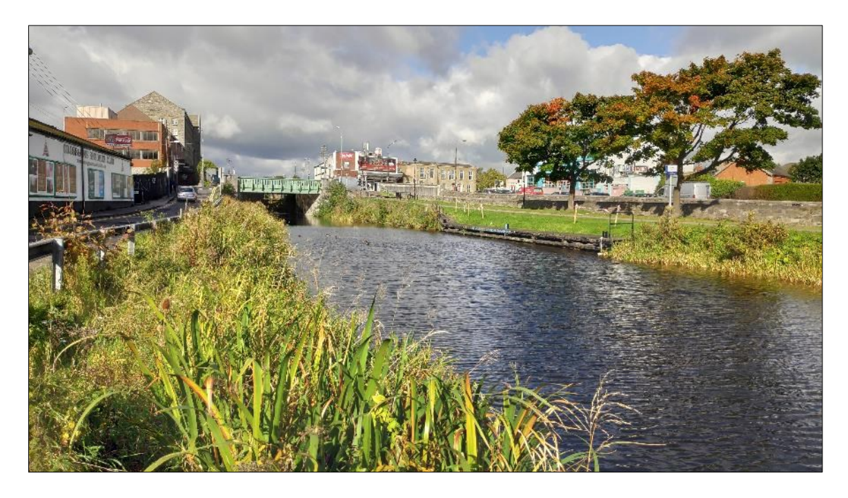
Plate 3.4 Representative image of site RC1 on the Royal Canal at Phibsborough (5<sup>th</sup> lock)

In summary, this site on the Canal and situated within the Royal Canal pNHA (002103), exhibited high coarse fish habitat, high European eel habitat, and of high quality for otter as a foraging area.