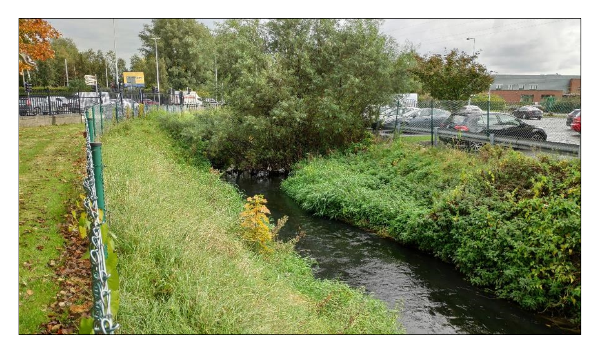
Plate 3.10 Representative image of site C2 on the River Camac (upstream of the culvert)

The presence of a healthy Annex II white-clawed crayfish population, in addition to excellent brown trout habitat and good lamprey habitat summarizes the key habitats found at this site.