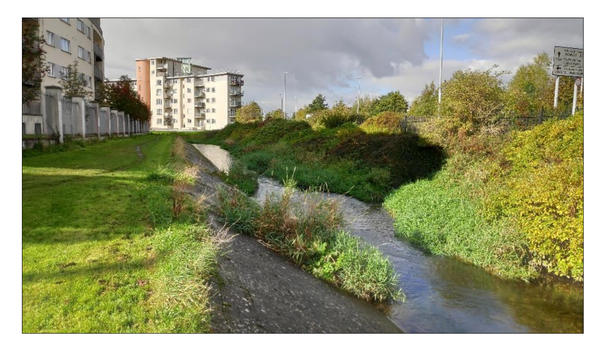
Plate 3.9 Representative image of site C1 on the River Camac (facing upstream)