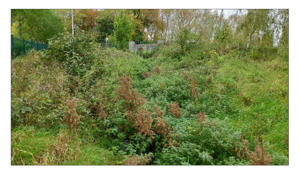
Plate 3.12 Representative image of site P1 on the upper reaches of the River Poddle (heavily scrubbed-over, facing upstream to road crossing)