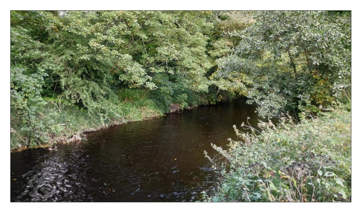
Plate 3.8 Representative image of site D1 on the River Dodder at Rathdown Park

In summary, given the excellent salmonid habitat - in particular spawning gravel, with other areas of good quality nursery and holding habitat observed at this site. Otter activity was not seen at this site during survey, but it is thought that habitat potential at this site was high for this species.