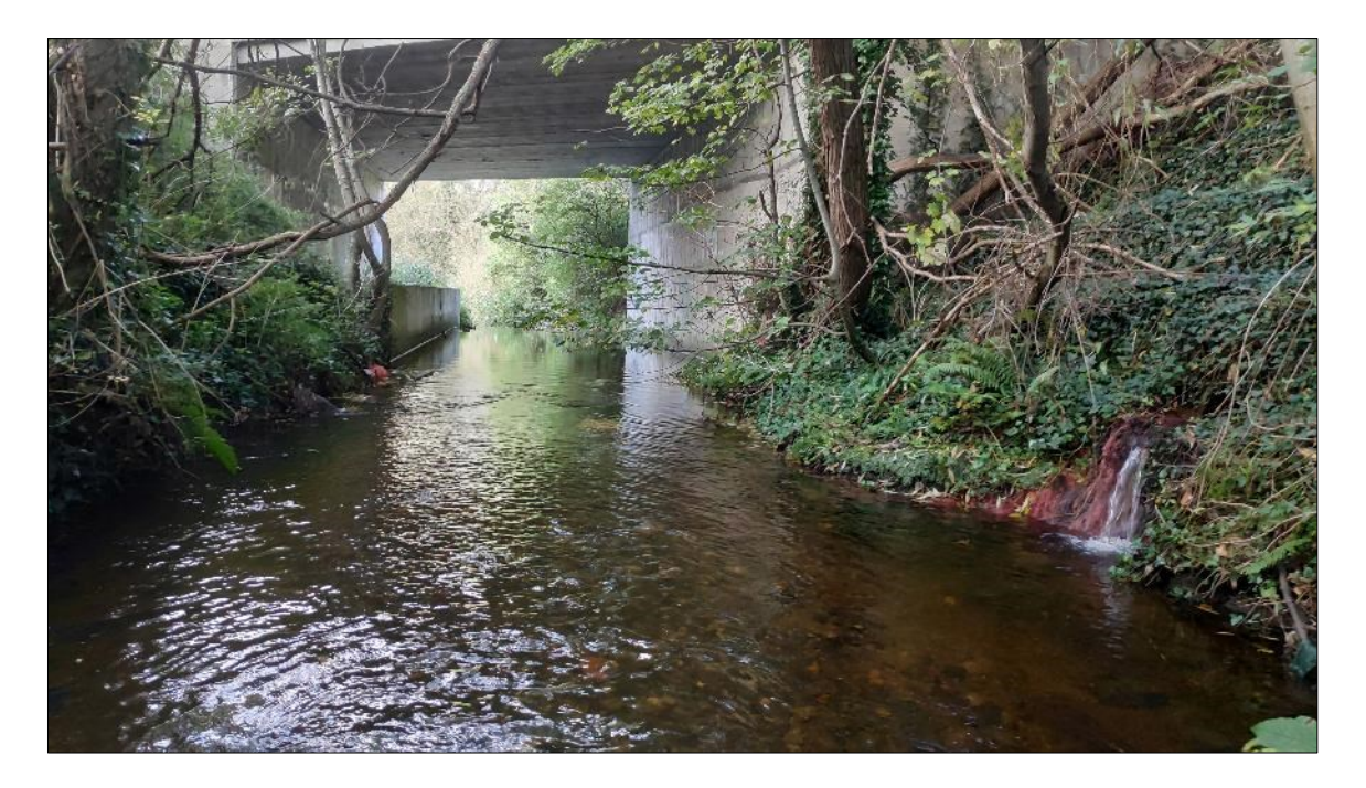
Plate 3.6 Representative image of site O2 on the Owendoher River (facing downstream towards road bridge with point source evident in right foreground)

3.2.7 Site O3 – Owendoher River, Rathfarnham Mill (EIAR Reference CBC1012AR002)